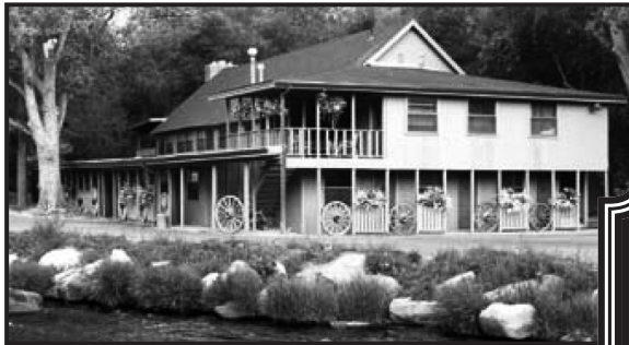
Reserve early to stay in the Wagon Wheel Lodge on the river (class meets in spacious ground floor room)